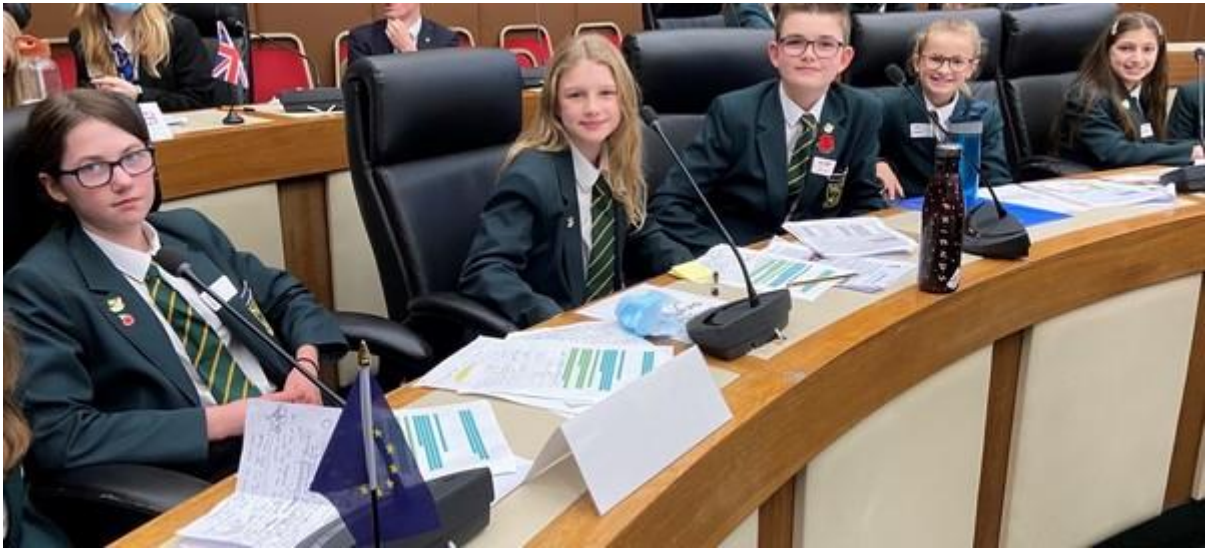
Photo caption: Students from Arden Academy eco-club at the Council Chambers

This month we share the inspiring work taking place in two secondary schools in the borough - Arden Academy (Knowle) and Langley School (Olton), as reported by the student reps from each school's eco-club: