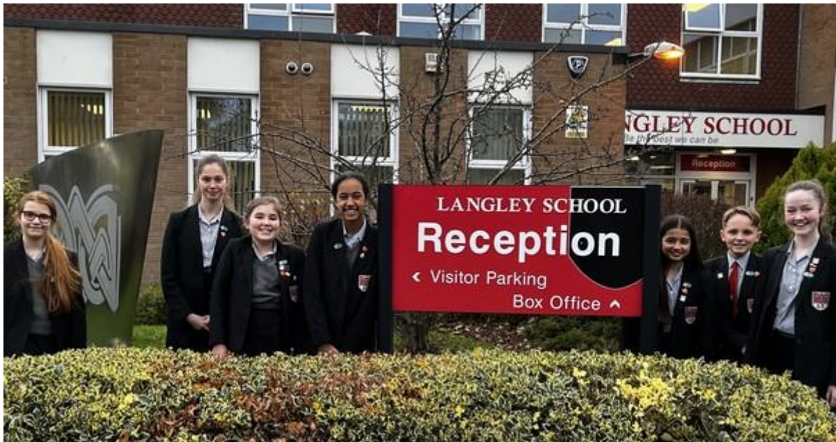
Photo caption: Students from Langley School eco-group

"Recently COP26 dominated the news headlines globally, with two weeks where climate change was the focus of much debate and negotiation and delegates from across the world assembled in Glasgow to share their concerns over the environmental crisis. Now, the world leaders might have gone home, but our work to ensure that we are all contributing to looking after our planet must continue.