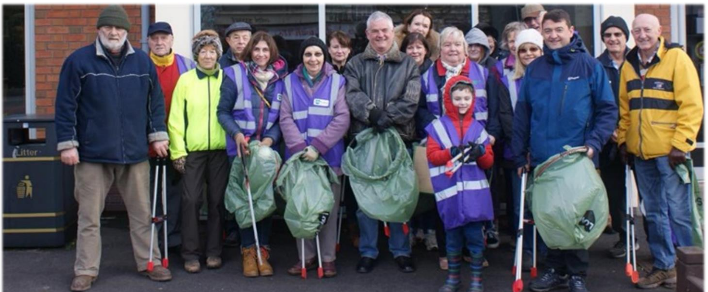
(group photo taken pre-COVID)

For more information about joining, email Love Solihull